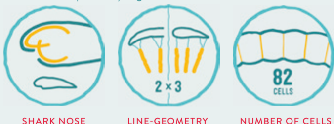
SHARK NOSE LINE-GEOMETRY NUMBER OF CELLS

The BUTEO XC is designed to be the ultimate XC machine. That means we have been tweaking all aspects of performance regardless of flat land or alpine flying.