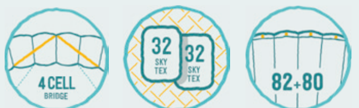
V-TAPE-TYPE CANOPY MATERIAL MINIRIPS

The glider has a moderate trim speed, allowing you to turn flat in light thermals, while being agile enough to also turn tight in strong, tough conditions. The 162 LE-ribs creating an incredible smooth top-sail surface, which enables ultimate gliding performance even in moving air. The entire concept is trimmed