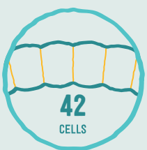
NUMBER OF CELLS